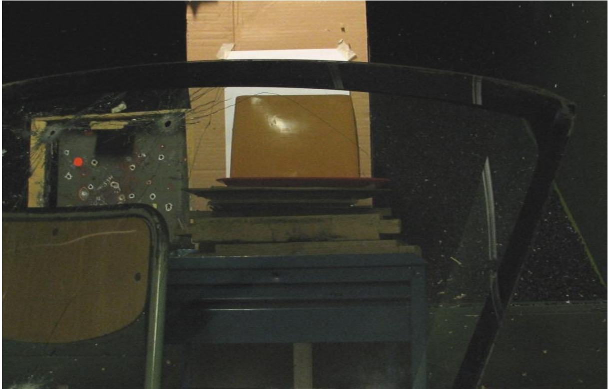
The test setup.