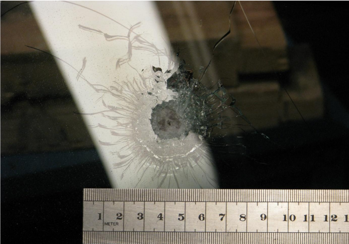
The bullet hole in the windshield. The limited area of cracked glass compared to other tests indicate that the bullet used little energy to penetrate the windshield.