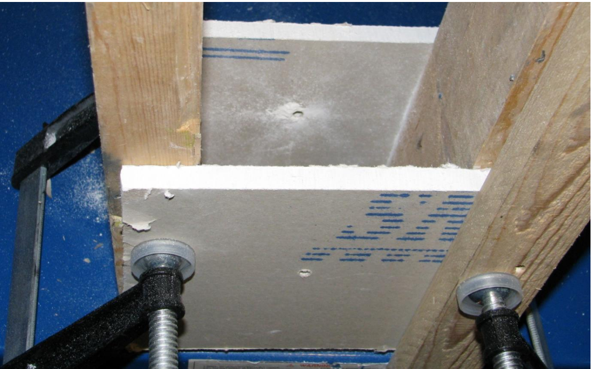
The interior wall after the shot.