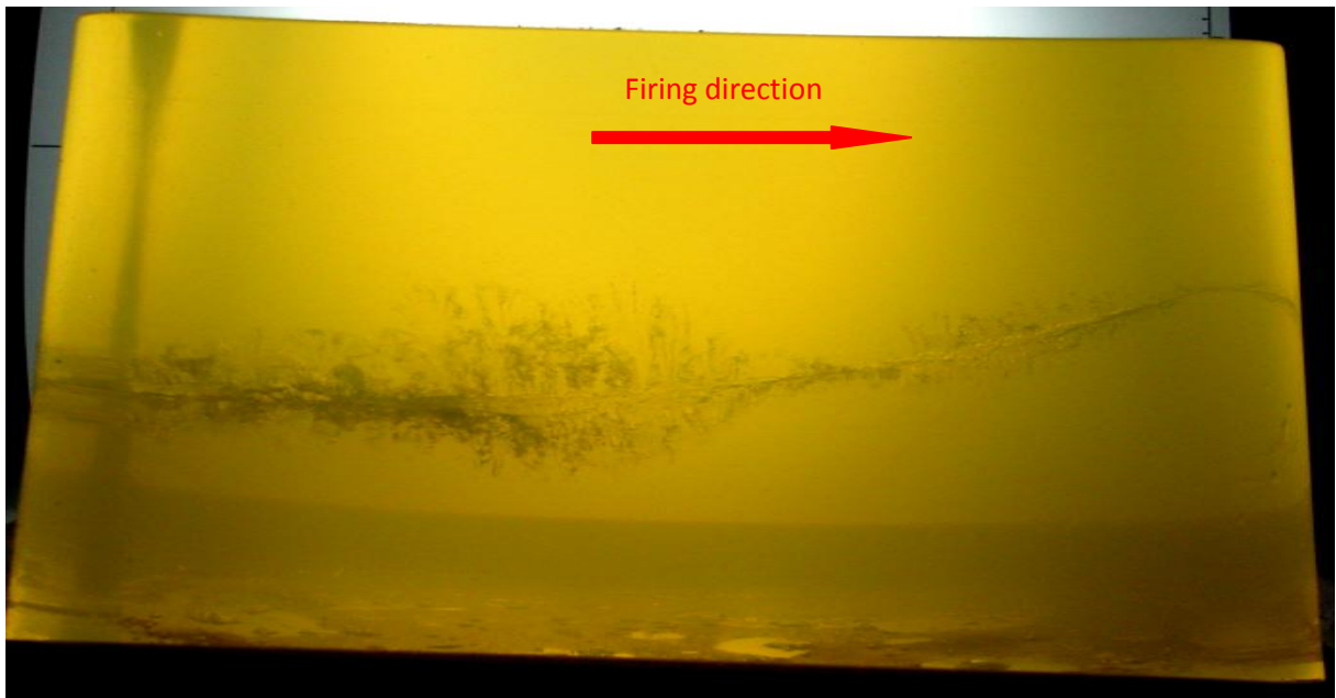
The gelatin block after the shot.